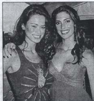
Models backstage at Lycra Xtra Life Show

I arrived on time and the festivities were underway. No spices needed for flavor.