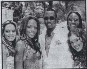
It's good to be the mayor. Sean "Diddy" Combs poses to preserve all that is sexy in Miami—at least while the MTV Video Music Awards are in town.